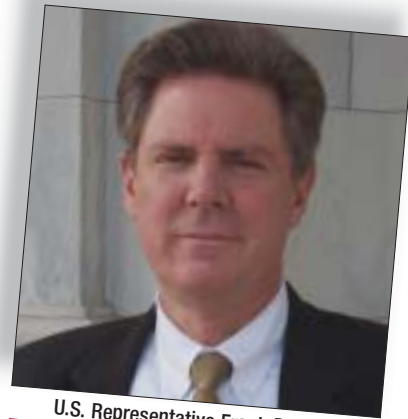
U.S. Representative Frank Pallone

In the 12th Congressional District, Holt defeated his Republican challenger by just under a 2-to-1 margin in Middlesex County.