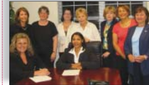
Members of the Middlesex County Democratic Elected Women’s Caucus met for its first meeting at MCDO headquarters earlier this fall.

“The first meeting was exciting and very well received by the elected officials who attended,” she said. “We are committed to the women running