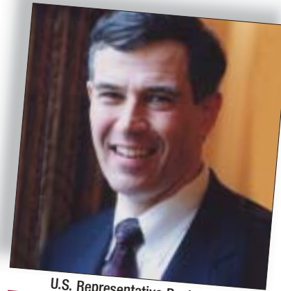
U.S. Representative Rush Holt