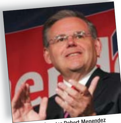
U.S. Senator Robert Menendez

Following his victory, Menendez was tapped to join the Senate Foreign Relations Committee. He said after billions in “national treasure spent,” thousands of American troops wounded and over 2,800 lives lost, “it is now clear that we must transition