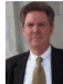
Congressman Frank Pallone