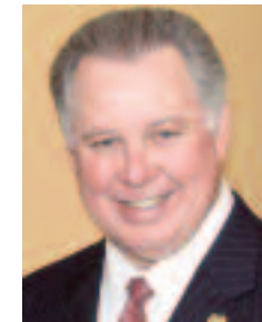
Congressman Albio Sires