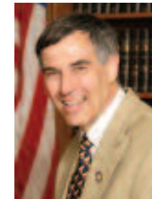
Congressman Rush Holt